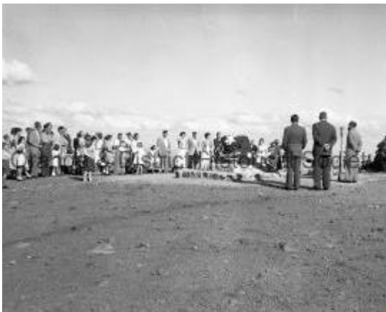
Unveiling of the Plinth on Mt Canobolas, 23/5/1956