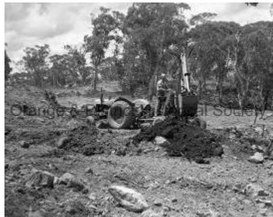
Work on the ABC transmitter on Mt Canobolas, 2/2/1962.

While what occurred on the mountain in the past gave no consideration to environmental, historical or cultural values, we cannot ignore that heritage in this day and age. We have a duty to preserve / protect / conserve / respect what remains and to prevent short-sighted, un-warranted development proposals that would impact that heritage.