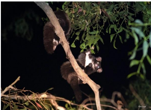
Greater gliders in the SCA