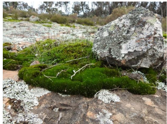
The world of bryophytes at the Walls, Mt Canobolas.